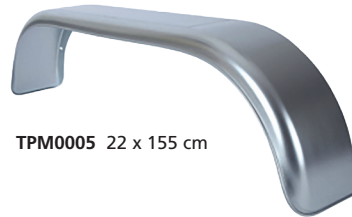
TPM0005 22 x 155 cm