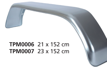
TPM0006 21 x 152 cm TPM0007 23 x 152 cm