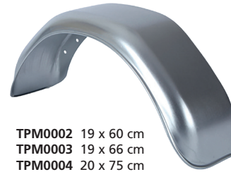
TPM0002 19 x 60 cm TPM0003 19 x 66 cm TPM0004 20 x 75 cm