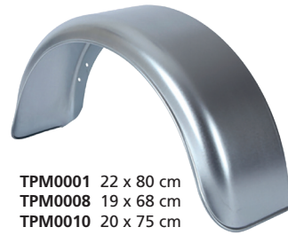
TPM0001 22 x 80 cm TPM0008 19 x 68 cm TPM0010 20 x 75 cm