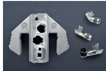
DSQIH1 For spark plug connectors 1 mm 2