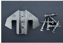
DSQIC1 For open-barrel terminals 0.1-0.25 / 0.25-0.5 / 0.5-1.0 mm 2