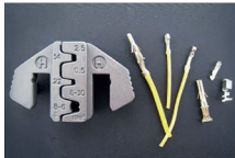
DSQIH For open-barrel terminals & D-SUB V3.5 0.5 / 2.5 / 8-10 mm 2