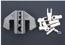
DSQIB For non-insulated terminals 1.5 / 2.5 / 6 / 10 mm 2